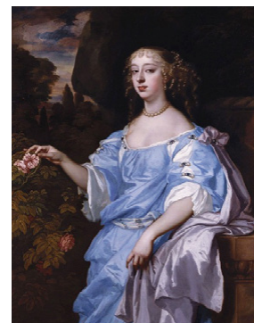
▲ Two of the 'Windsor Beauties', painted by Peter Lely, from Laurence Shafe's Zoom talk, 'The Power of Beauty in Restoration England'