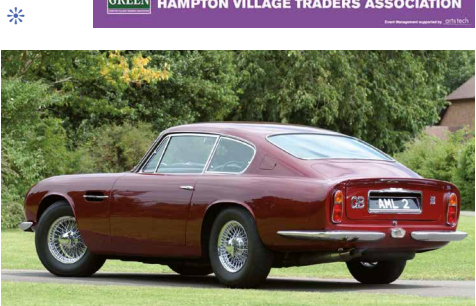
Photograph\ of\ 1958\ Lancia\ Aurelia\ courtesy\ of\ Bonhams;\ DB6\ courtesy\ of\ Aston\ Martin