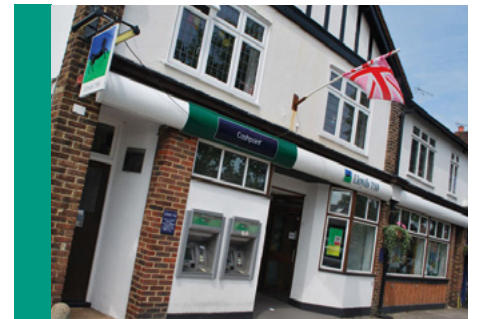
Lloyds bank in Wensleydale Parade is set to close at the end of July

Meanwhile, our local weekly newspaper, the Richmond & Twickenham Times, featured on its front page last week the long-threatened closure of our sorting office in Rosehill. Our newsletter readers learnt about it in our summer issue last year and a 2,500-signature protest petition to Royal Mail rapidly gained popularity. We knew then March 2019 was earmarked for closure, but now we're already in the target month and no further information is forthcoming. As far as the staff are concerned, 20 will continue working for Royal Mail, while the remaining five have decided not to move with their colleagues to the much larger office in Ashford. THS