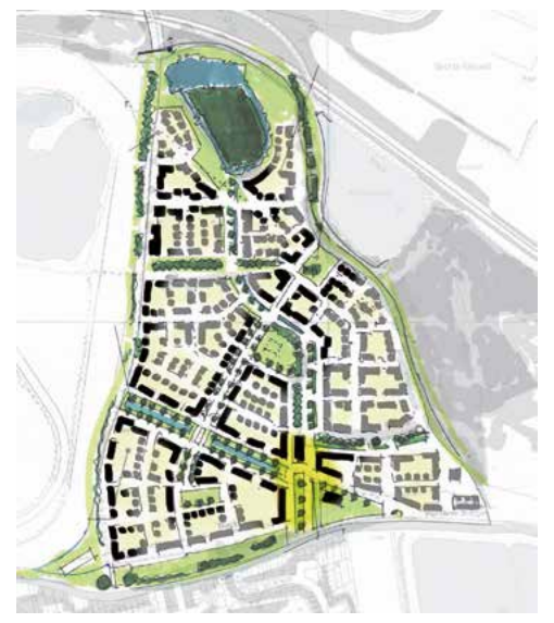
Above is a plan from 2014 showing an initial concept for the development at Kempton Park from a brief to architects competing to design the new suburb that the Jockey Club wants to build on this stretch of Green Belt.

I was interested to learn, in the case of the Alderson Garage proposal, that developers can make applications for buildings they don't actually own – extraordinary! It's no wonder then that the Jockey Club, in spite of strong local opposition and knowing that