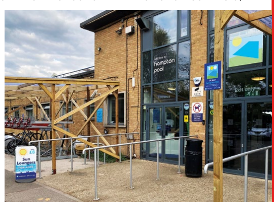
▲ Hampton Pool has new covered double-decker bicycle racks either side of the main entrance thanks to the Community Fund

available, this is a competitive process and organisations should make sure that their project closely aligns with the priority areas for the fund.